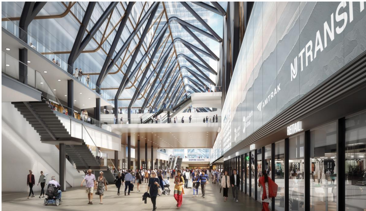
Concept Rendering by MTA

Proposal 1: The Proposed Empire Station Complex North/South Atrium Between Madison Square Garden and 2 Penn Plaza