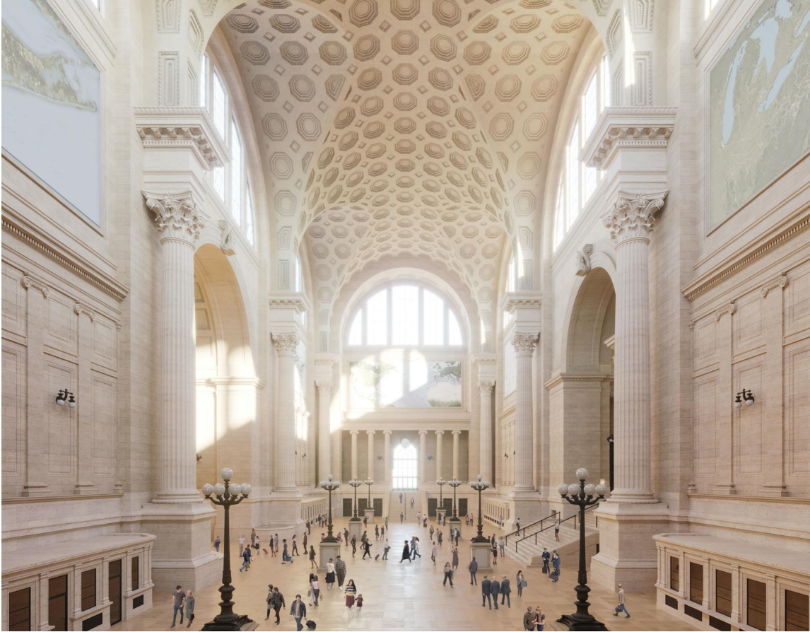
Rendering by Nova Concepts

Here, we see a rendering of a rebuilt original Penn Station's mid-block Main Waiting Room for today--high ceilings, clerestory windows and so much more. This is but one of many light filled rooms in the original station. With modern construction techniques and computer generated design, recreating the original station would be far more price effective than one might anticipate. We believe it could be reconstructed for a lesser cost than the PATH Oculus Station which only serves some 65,000 plus commuters. Penn Station serves over 650,000 commuters and that number is expected to grow.